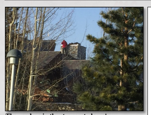
They end up in the strangest places! Douglas County SAR personnel snapped this picture of a SAR members locating a missing woman in the most unlikely of places... the roof of a golf course clubhouse! Excellent search technique and cell forensics aided the team in the